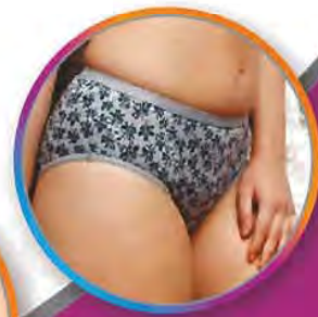
Intimate Regular Panty